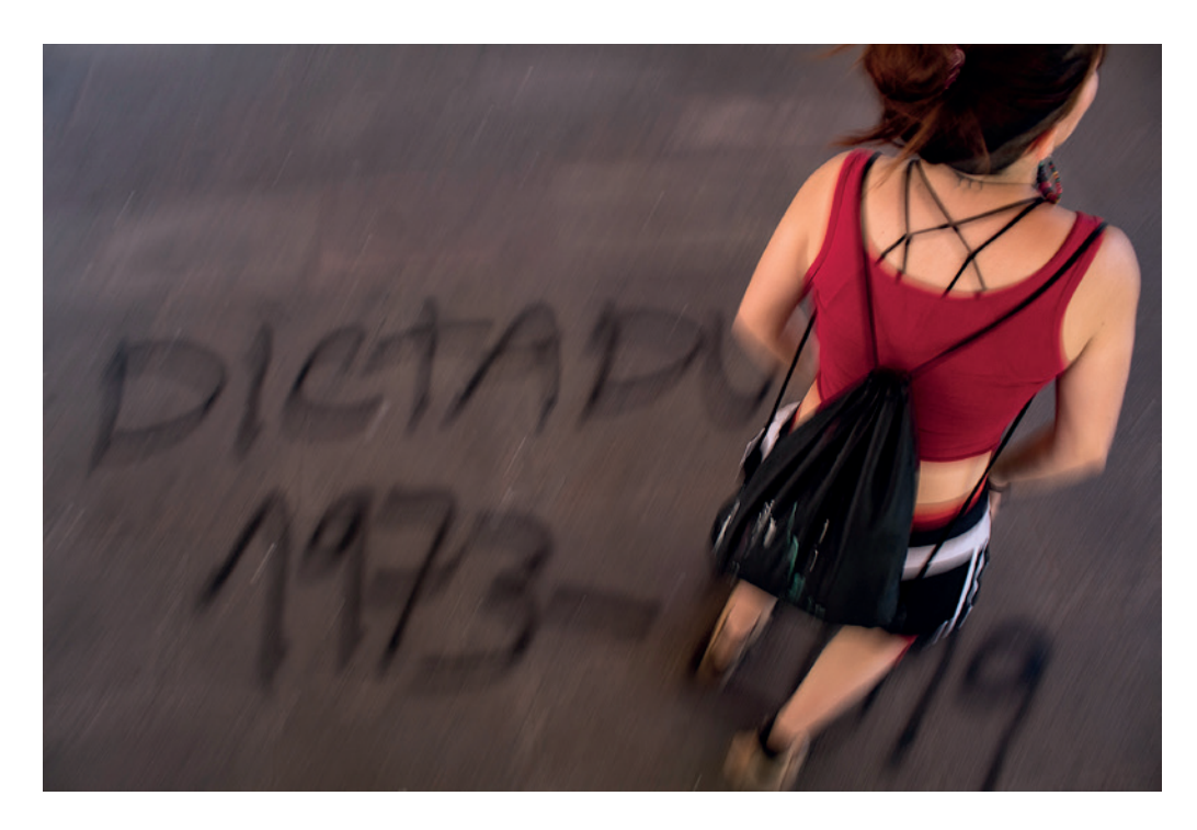
Fig. 3. Santiago, Chile, estallido social, October 2019. Text: Dictadura 1973– 2019 (Dictatorship 1973–2019). Photo: Jimmy Rojas Ramírez, 2019.