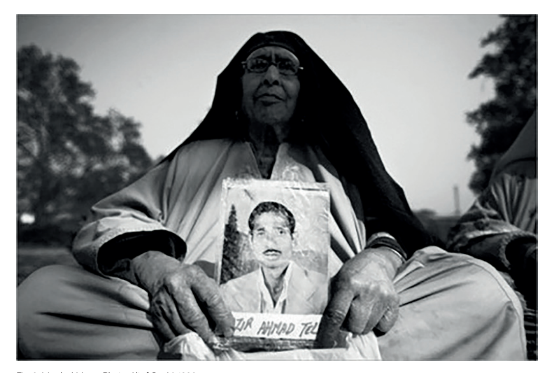
Fig. 2. Mughal Mase.