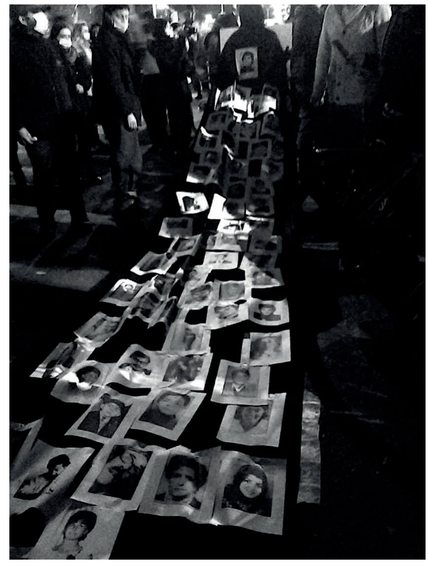
Fig. 5. Estadio Nacional (National Stadium), Santiago, Chile, 11th of September 2022. Vigil on the 49th anniversary of the coup. Performer clad in black clothes and hood hauls a long black cape with attached photo portraits of political detainees disappeared during the dictatorship.