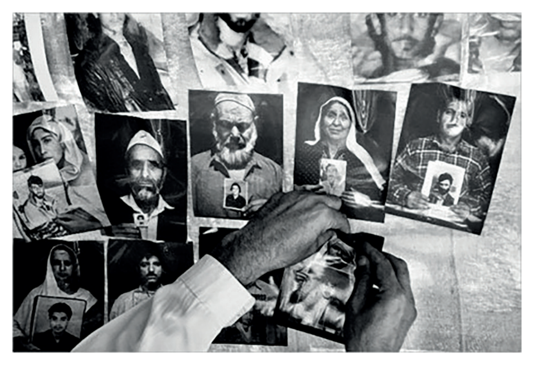
Fig. 4. Families of the enforced disappeared pinning photographs. A still from Where Have you Hidden My New Moon Crescent, 2009.

why are you hiding, crescent of the new moon, I wait all day, but you ignore me."