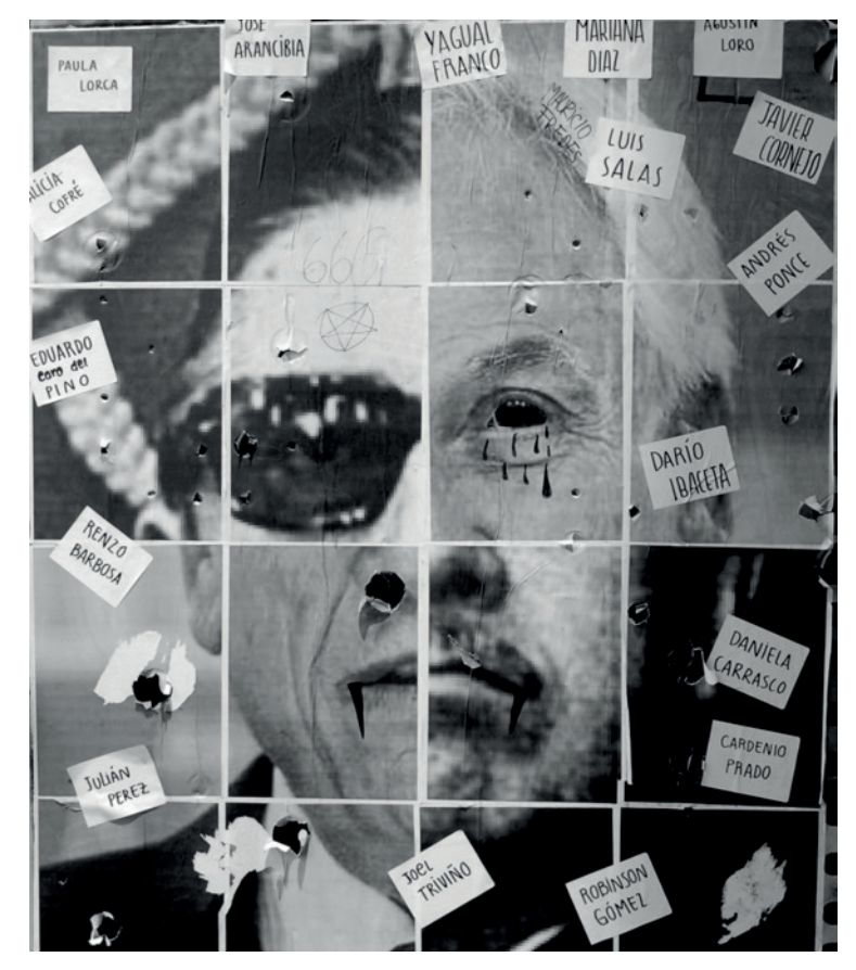
Fig. 4. Santiago, Chile, estallido social, January 2020. Wall poster with composite portrait of General Pinochet (left) and Chilean President Sebastián Piñera, with names of victims of police violence during the 2019–2020 people's revolt.