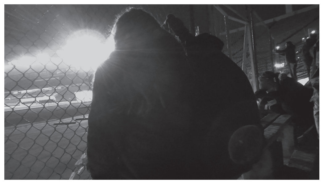
Fig. 2. Estadio Nacional (National Stadium), Santiago, Chile, 11th of September 2017. Vigil on the 44th anniversary of the coup. Young mourners sit on original wooden benches where prisoners sat in 1973.