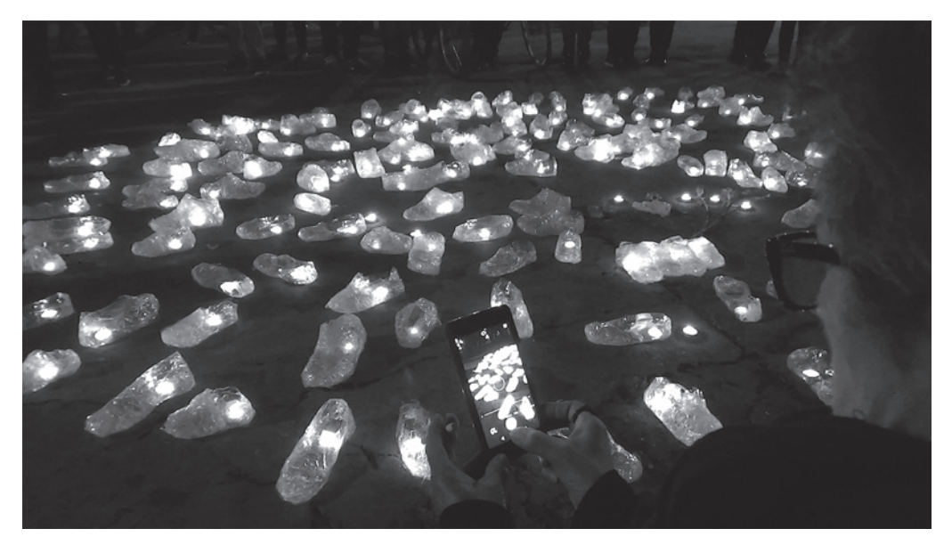
Fig. 1. Estadio Nacional (National Stadium), Santiago, Chile, 11th of September 2017. Vigil on the 44th anniversary of the coup.