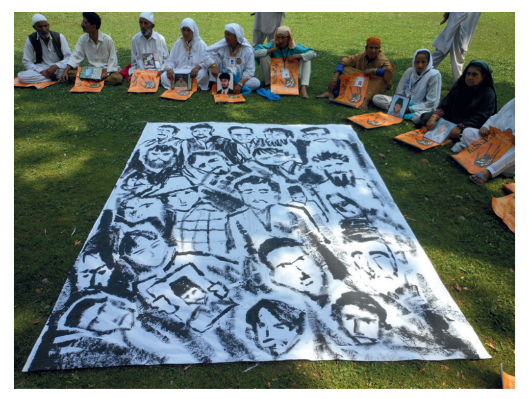
Fig. 1. APDP protest, International Day of the Disappeared, August 30, 2008.