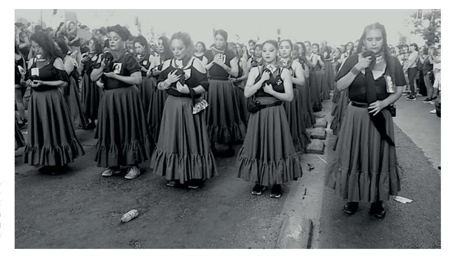
Fig. 6. Alameda Avenue, Santiago, Chile, 8th of March 2023. International Women's Day public rally: dancers wear portraits of women disappeared or murdered during the dictatorship.

Fig. 5. Estadio Nacional (National Stadium), Santiago, Chile, 11th of September 2022. Vigil on the 49th anniversary of the coup. Performer clad in black clothes and hood hauls a long black cape with attached photo portraits of political detainees disappeared during the dictatorship.