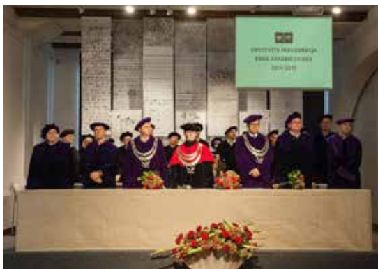
Ludmiła Ostrogórska, the first female rector of the Academy of Fine Arts in Poland, Academy of Fine Arts in Gdańsk.