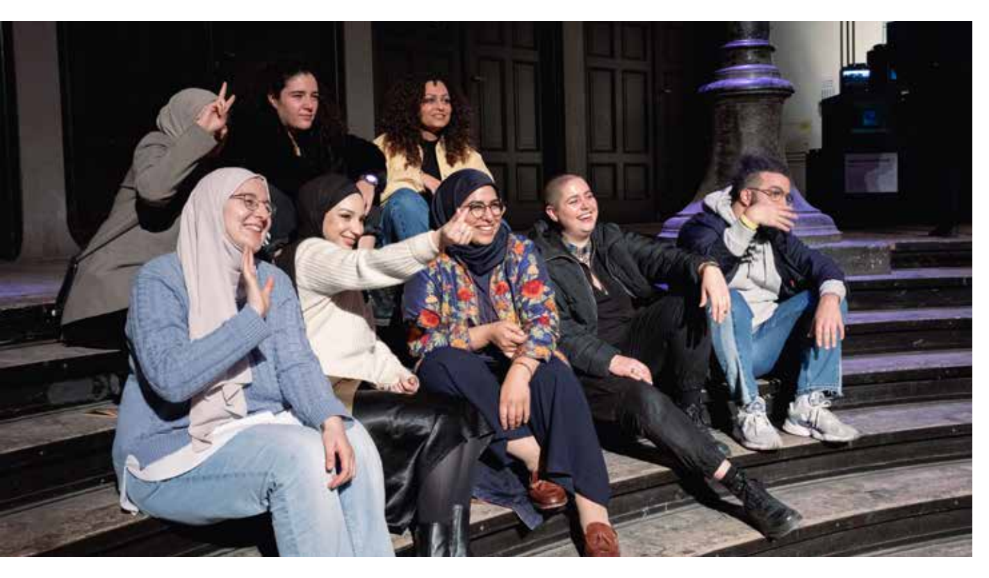
A group portrait of the artists and speakers in the exhibition