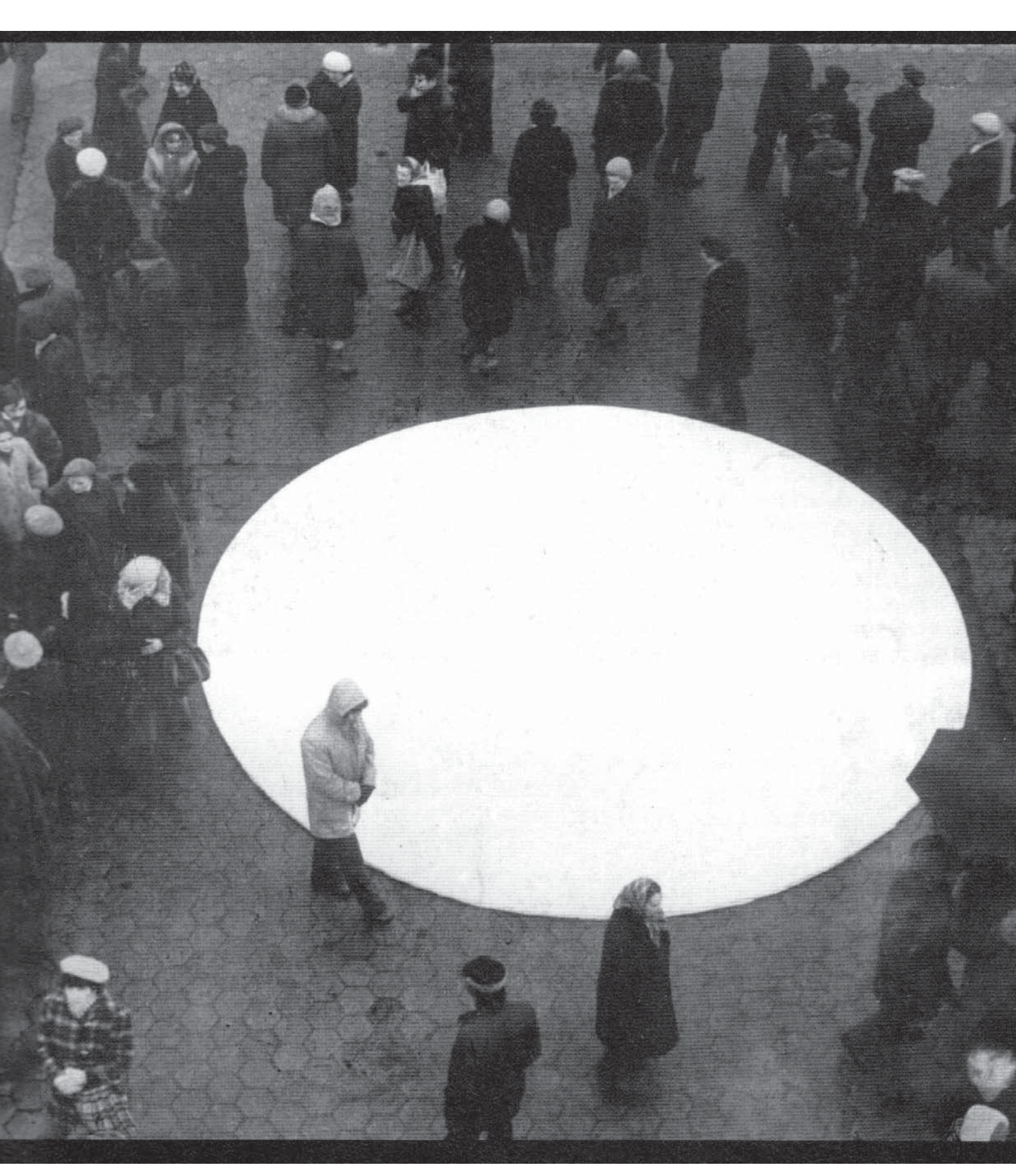
{\it Construction\ in\ Process}, still\ from\ Jozef\ Robakowski\ film, action\ by\ Sol\ LeWitt.\ Courtesy\ of\ the\ author.