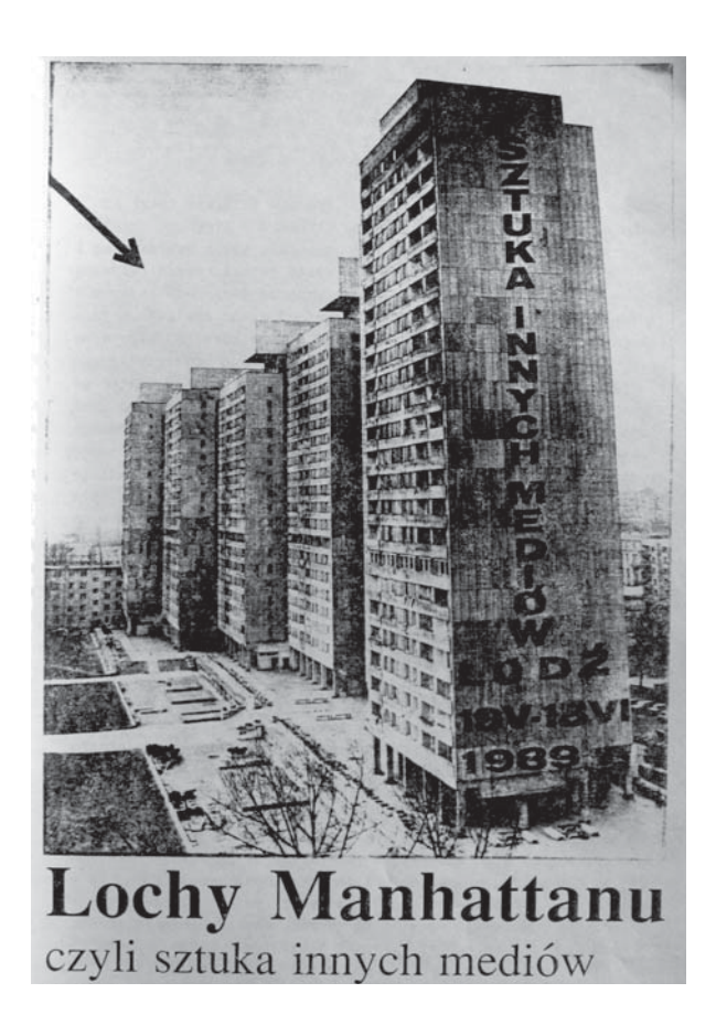
Lochy Manhattanu, 1989, exhibition preview invitation.