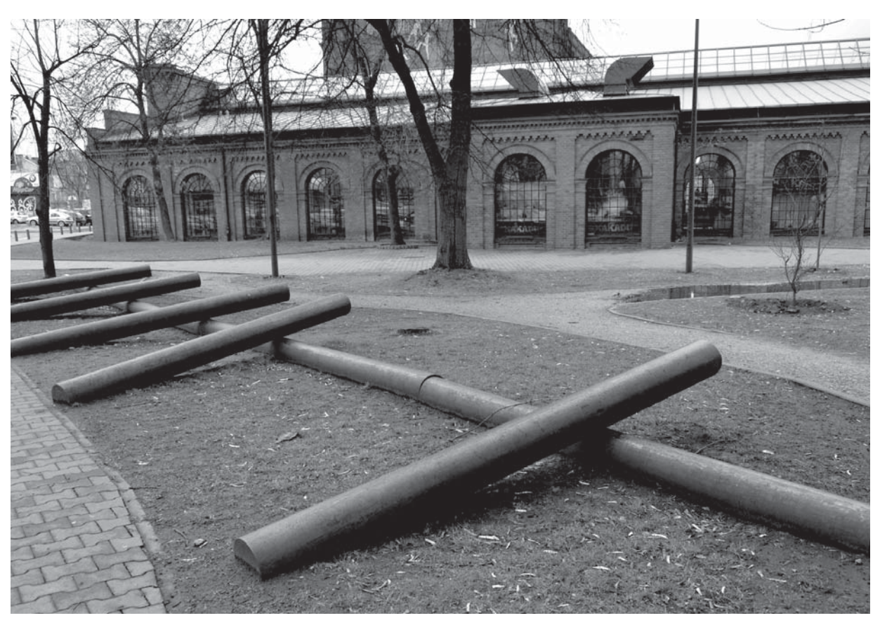
Richard Nonas, Milczący Sojusznik, 1991