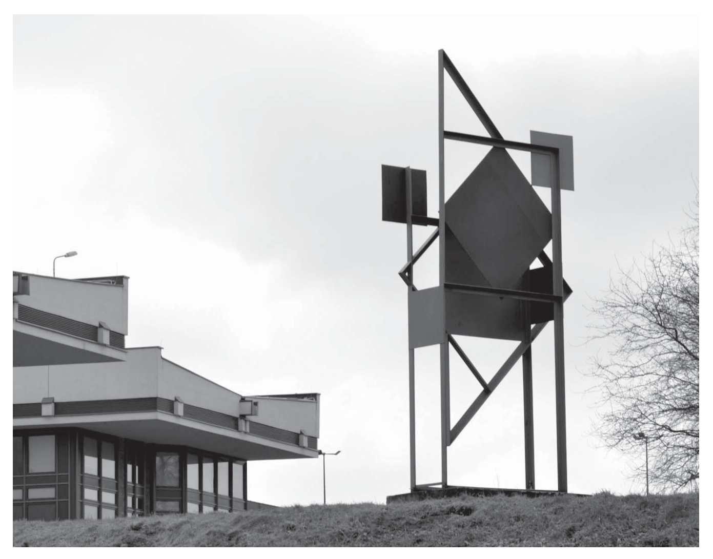
Spatial composition by Henryk Stażewski, fot. Julia Sowińska - Heim.