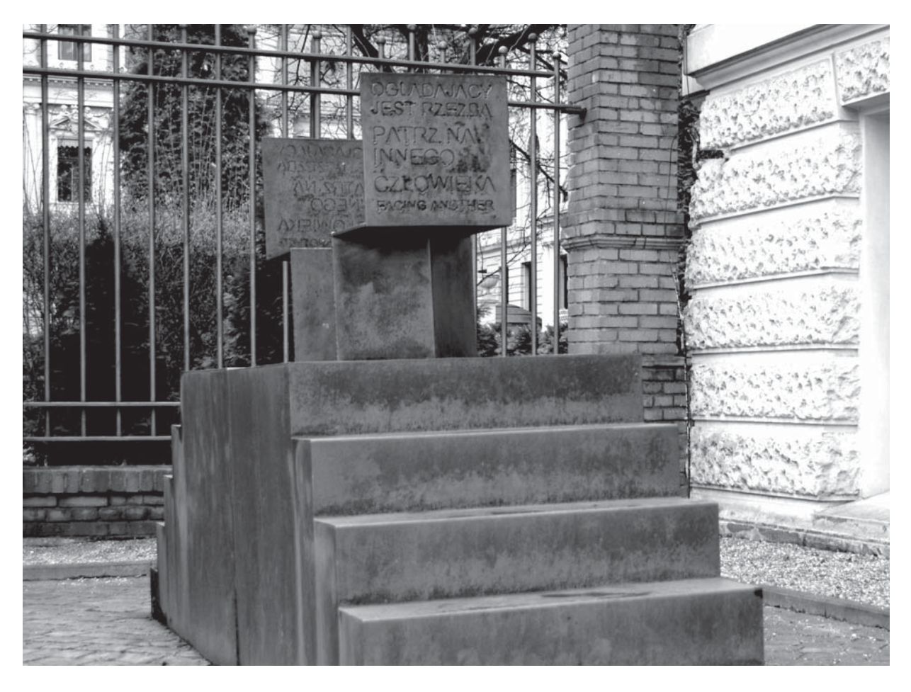
Buky Schwartz, Sculpting\ the\ Spectator, 1993, fot. Julia Sowińska - Heim.